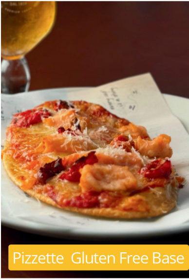
Pizzette Gluten Free Base