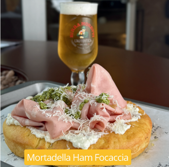
Mortadella Ham Focaccia